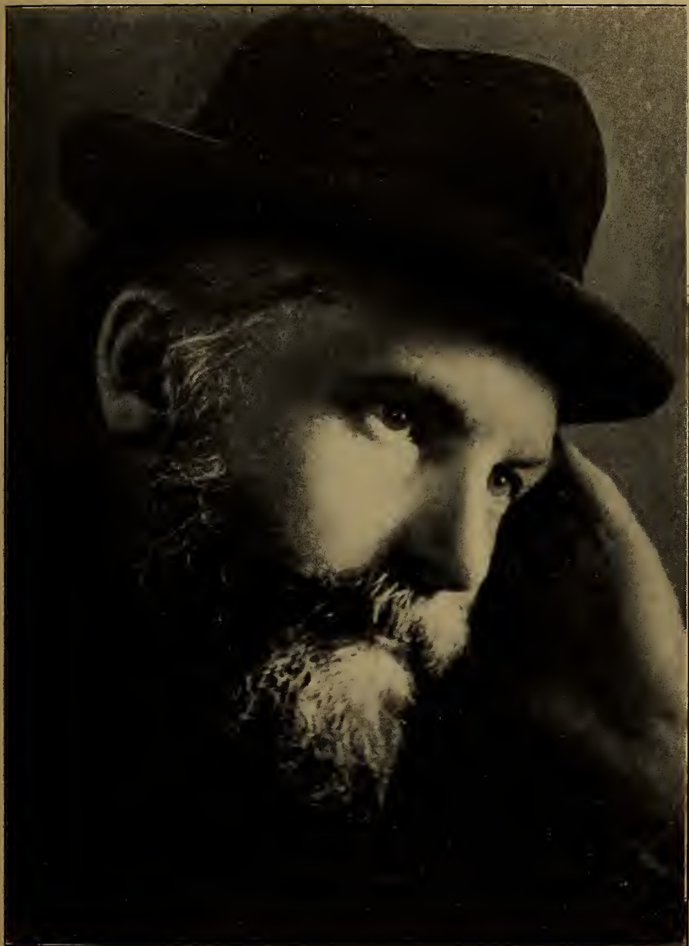
MR. FREDERIC W. H. MYERS